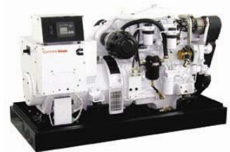
Standard model without sound shield