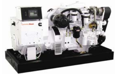
Standard model without sound shield