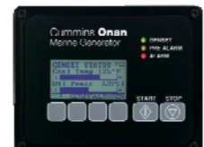
Cummins Onan Digital Display