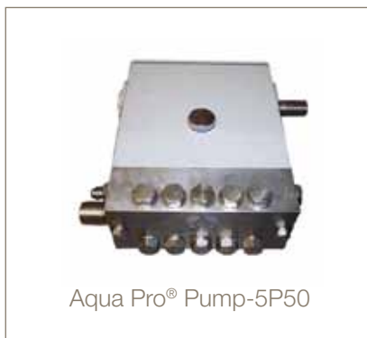
Aqua Pro ® Pump-5P50