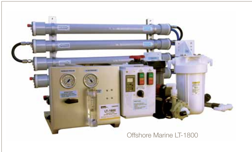
Offshore Marine LT-1800

The units feature a semi modular frame format, for installation flexibility. The frame is compact and can be above or below the water line. The boost pump and prefilters are supplied as loose items.