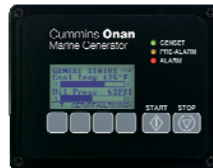
Cummins Onan Digital Display