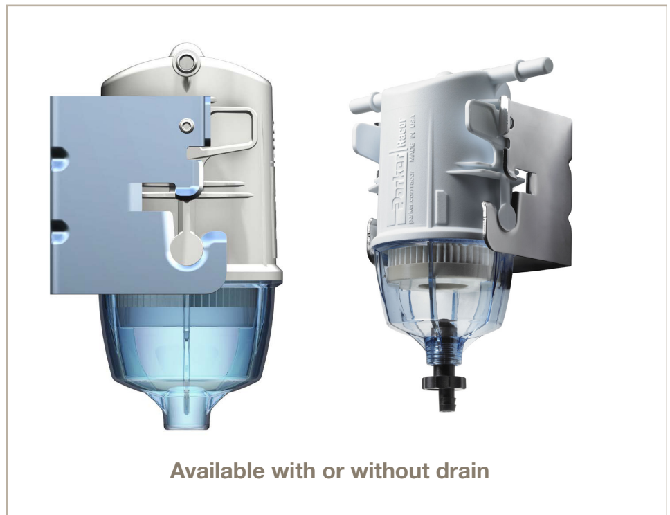
Available with or without drain

The one piece bonded construction means that there are no replacement seals. This also results in E10 gasoline and B20 biodiesel compatibility.