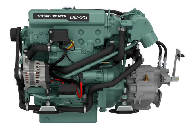
The compact and reliable D1 and D2 diesel engines are available from 12 to 75 hp.